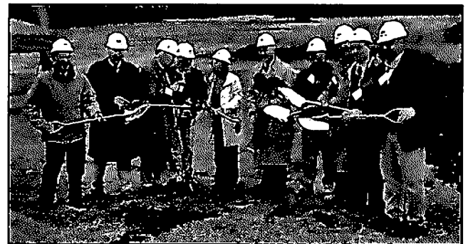
SBE Groundbreaking - April 17, 2010

SBE - The town closed the real estate sale to the partners who will own the 10-acre lot on which SBE's new plant is being built. The VT Dept. Of Housing & Community Affairs, Community Development Program, offered the Selectboard a grant agreement (for the grant awarded last October). In March the Selectboard adopted the necessary resolution and authorized signing of documents to complete the loan to SBE. SBE's contractors have begun work. They expect their new 52,000 s.f. facility to be finished late this year. Production of power rings in the new plant is expected to start early next year.