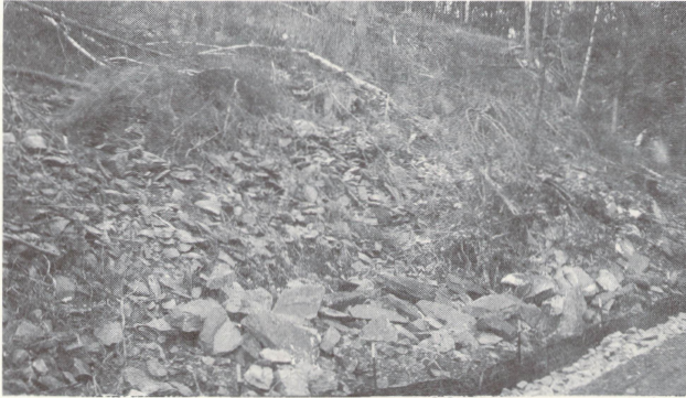
Dirt 2'-3' deep will be removed from this bank below the railroad switchback and be replaced with large stone and bin-walls.

The VT Agency of Transportation hired CCS Constructors, of Morrisville, to repair the Sterling Hill railroad switchback. This work will be focused on the 400' area that experienced a slide immediately following the May 2011 storm. The process involved in the project is designed to prevent the side of the hill from continuing to slide away, taking the rail and subgrade material with it.